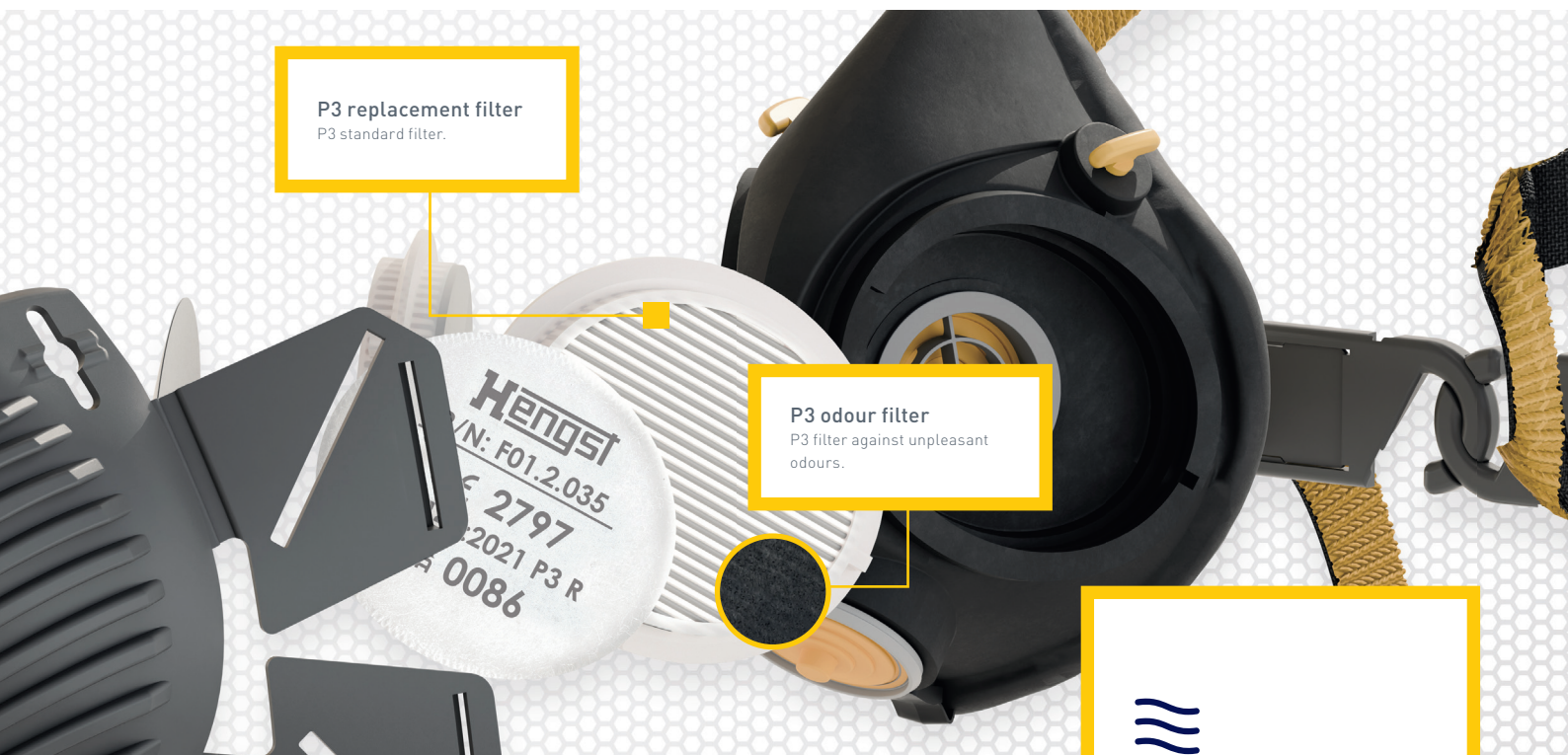
P3 replacement filter P3 standard filter.

Article number: F01.2.035 | Article number: F01.2.036